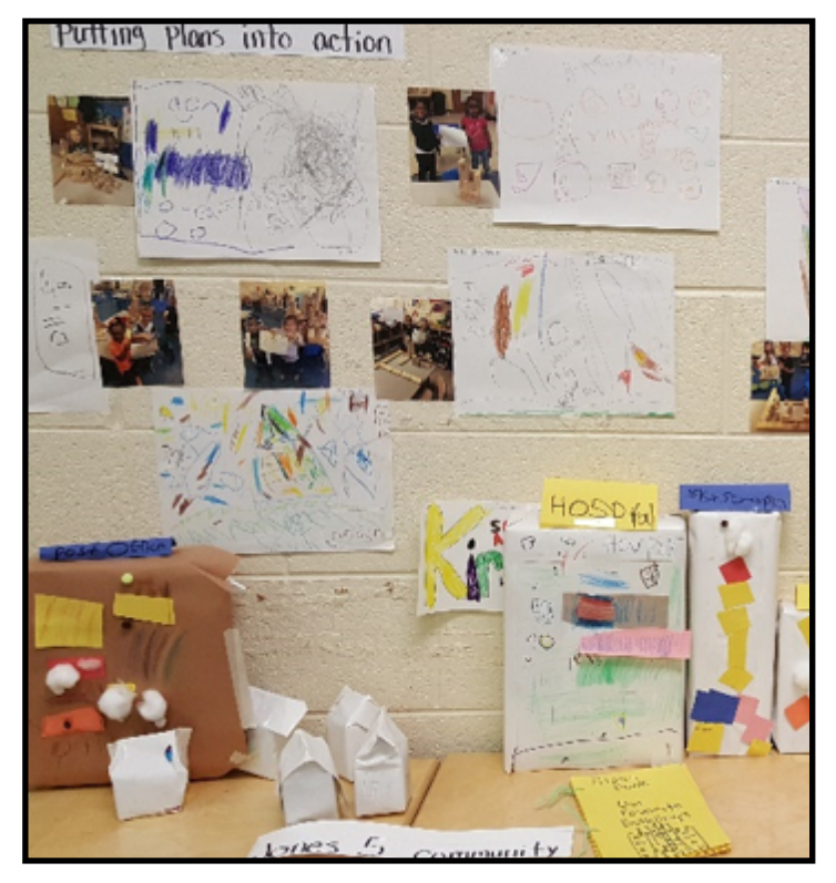
During a building study, the teacher provides children with authentic literacy opportunities by inviting them to create blueprints & buildings