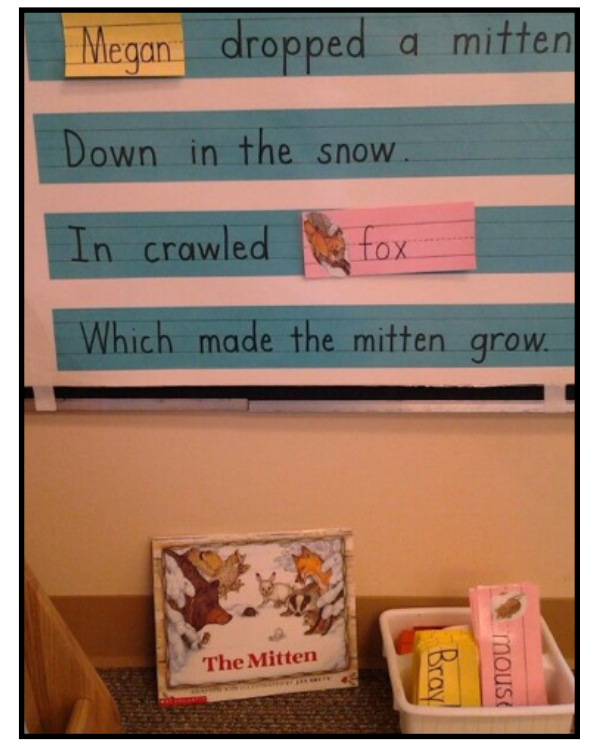
An interactive chart encourages the children to play with & manipulate language using a familiar story. This can be extended further by having children create their own movable pieces