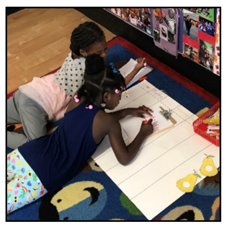
The teacher provides materials to enable children to retell a familiar story and explore writing