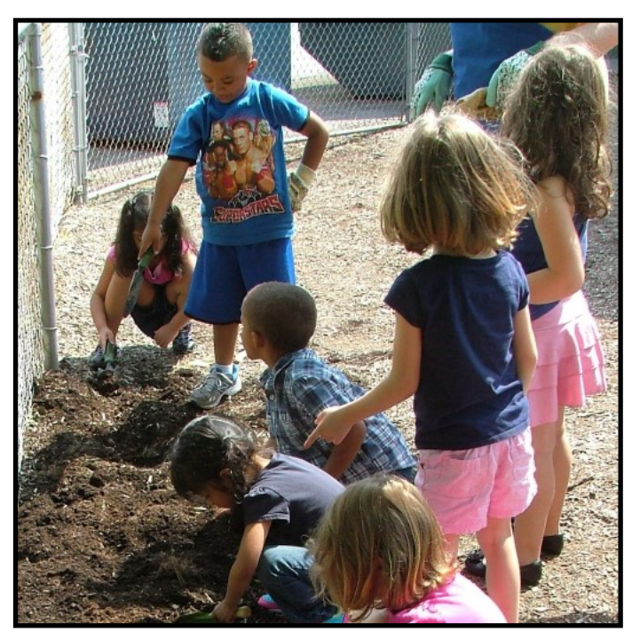
Children preparing a class garden