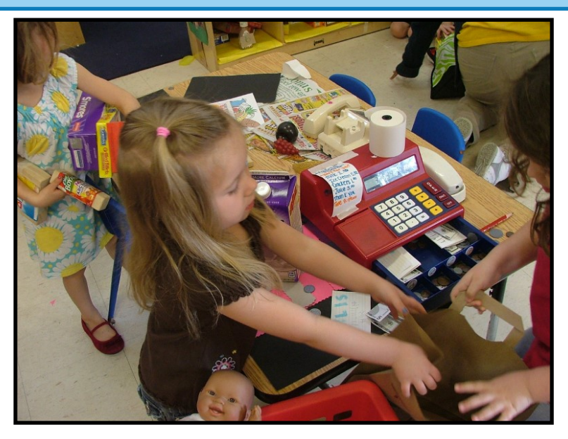
At the grocery store