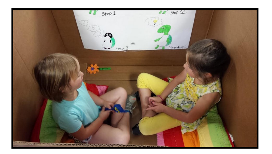
Children talking out a solution to a problem in the "Peace Corner"