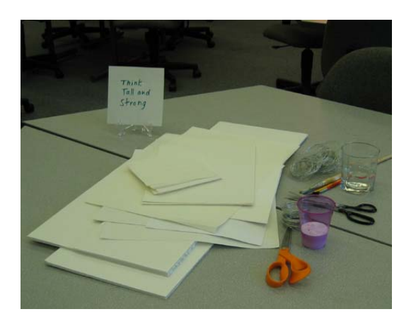
Figure 1: Think Tall & Strong

by incorporating provocations that welcome a playful attitude. Additionally, the group format will encourage solutions to open-ended processes that will be collaborative.