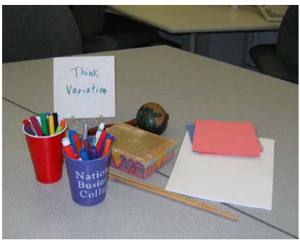
Figure 4: Think Variation