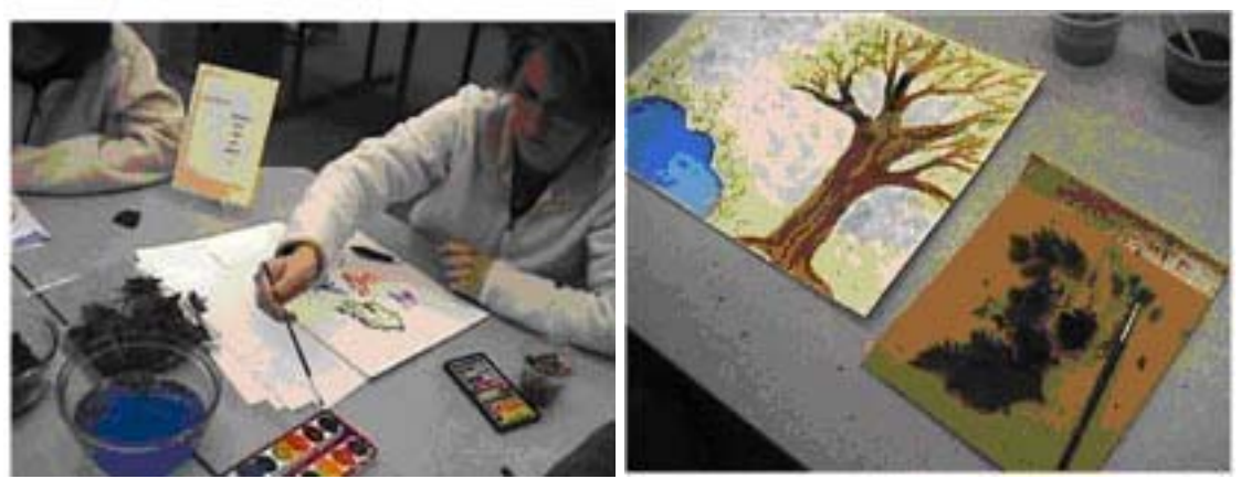
Figure 3a & b: Think Metaphor