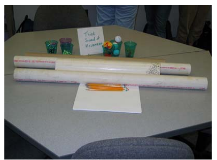
Figure 2: Think Sound of Movement