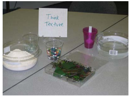
Figure 5: Think Texture