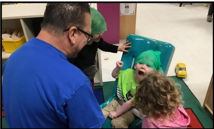
Inclusive classrooms allow for engaged learning for all children