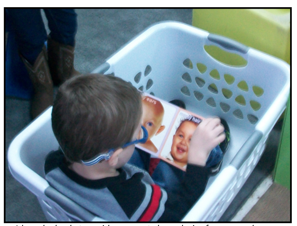
A laundry basket provides concrete boundaries for personal space